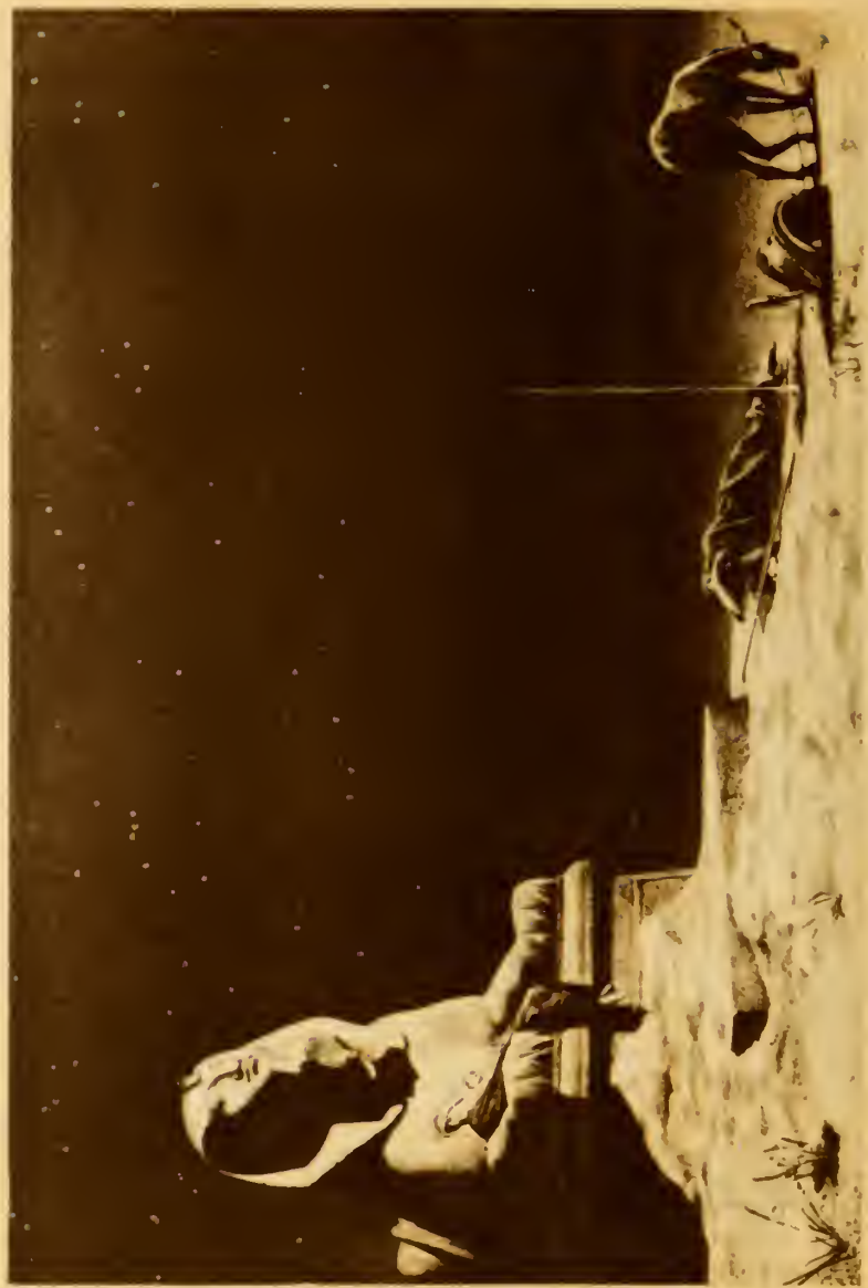
“Who arose and took the Child and His Mother by night, and retired into Egypt.”